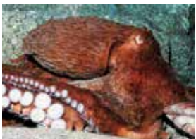
GIANT PACIFIC OCTOPUS