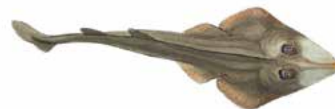
SHOVELNOSE GUITAR FISH

In what exhibit do you find these shark relatives?